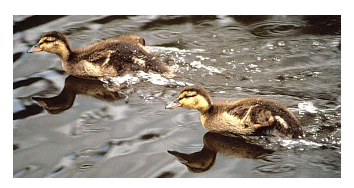
Written by Bea Silverberg